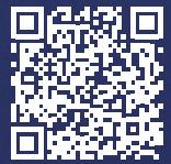
RUT240 360° VIEW