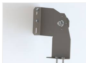
TYTAN LED, ATLAS LED, INDUSTRY LED - uchwyt regulowany (kpl. 2 szt.) (908200)